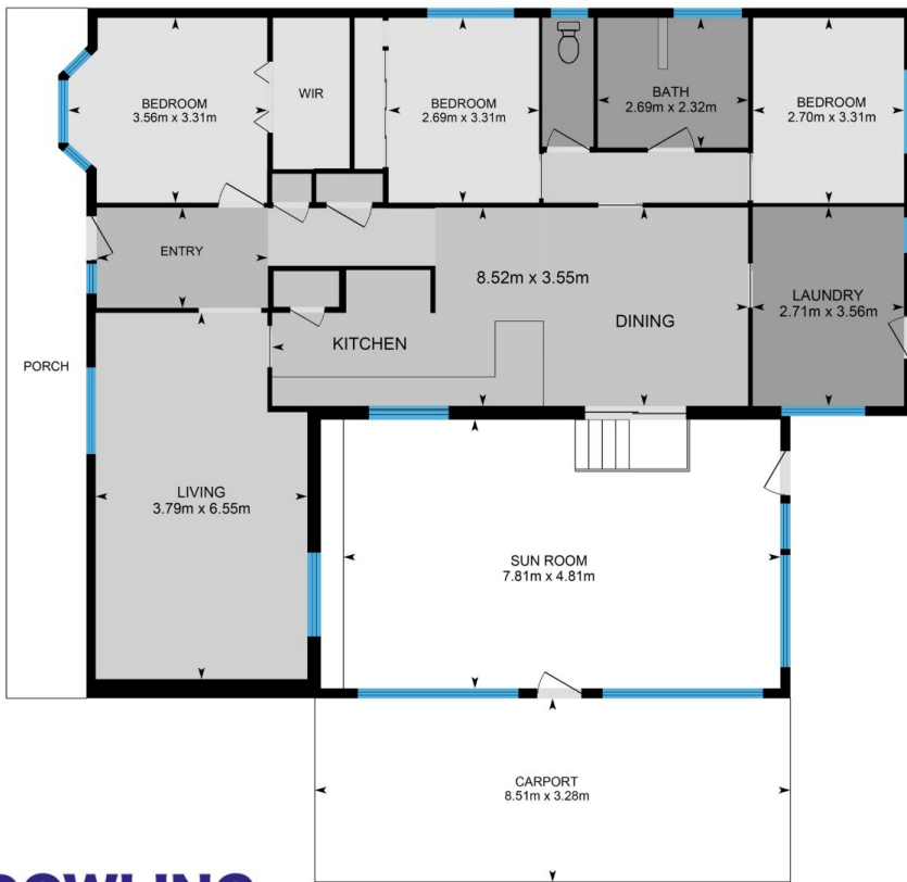
Site Plan Front

Measurements are approximate and are to be used only as a guide