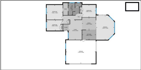
Front 2 Purcell St, Raymond Terrace